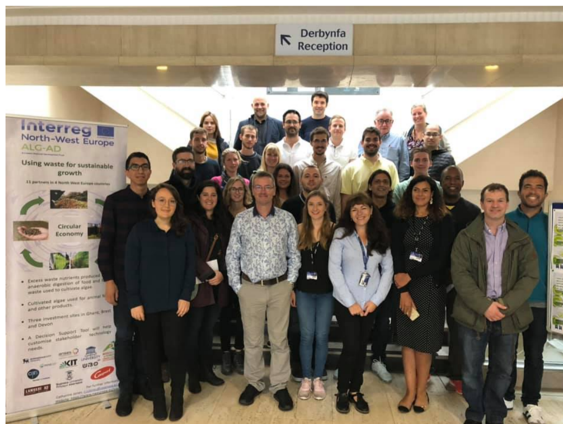
Workshop attendees comprising of students, consultants, and delegates from research institutions as well as SME's from the microalgae sector.

Follow the link to get a copy of September's Newsletter Special Issue and read about the EnhanceMicroAlgae's workshop at Swansea University!